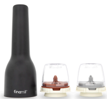
MIB Midnight Black