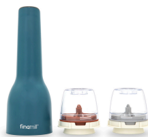
OCB Ocean Blue