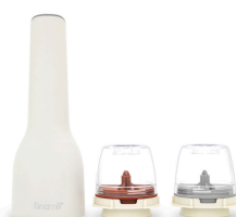
SOC Soft Cream